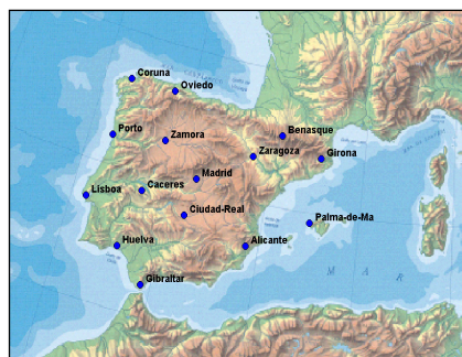
Figure 4. EGNOS virtual reference stations provided by BKG