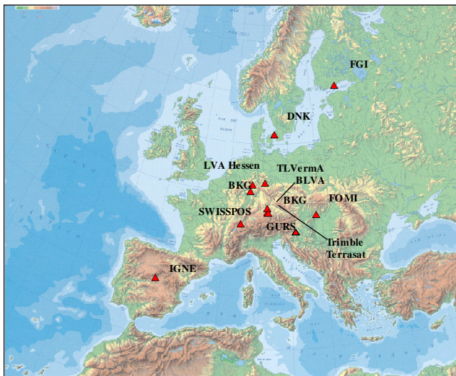
Figure 1. NTRIP Casters available in Europe

The public released NtripCaster software, available since February 2004 for disseminating real-time GNSS data via Internet, has made it possible to install a Broadcaster in Madrid. In order to ensure the reliability of the system, a dedicated Linux server with leased corporate independent Internet access has been set up. Within the framework of EUREF, this server is broadcasting today four GNSS data streams belonging to the Spanish ERGPS network, one of them RTK, and 15 virtual EGNOS DGPS streams in RTCM format covering the Iberian Peninsula. The concept of distributing a number of Broadcasters over the European continent leads to reduced latencies at the user end and enables sharing the workload of providers. A cross monitoring between all installations ensures control over the continuity of EUREF's services. Field tests using GPRS and other Internet connections show an excellent and unique opportunity to disseminate real-time GNSS data via Internet for the purpose of accurate positioning and navigation.