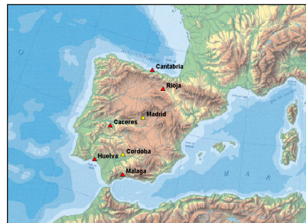
Figure 2. ERGPS Stations