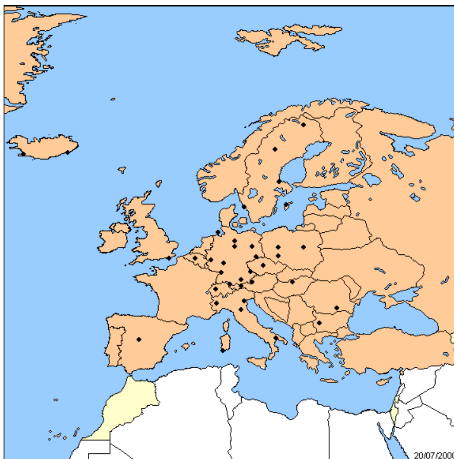
Figure 2 - EUREF stations submitting hourly tracking data

Only a few of the EUREF analysis centres presently attempt to apply their GPS-derived tropospheric zenith path delays to meteorology. An example is the GOP analysis centre (J. Dousa, in this volume ). At the AC workshop, the representative of COST 716 agreed to accept a representative of the EUREF AC's within COST 716. This more formal participation of EUREF to COST 716 will guarantee that any future steps towards an EUREF troposphere product will be in full compliance with the COST 716 recommendations.